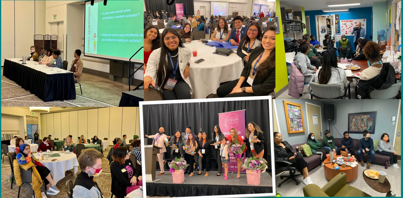
2022 Spring DEI Student Activism Summit