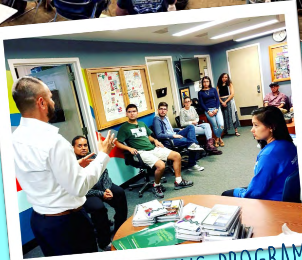
LATINX MENTORING PROGRAM