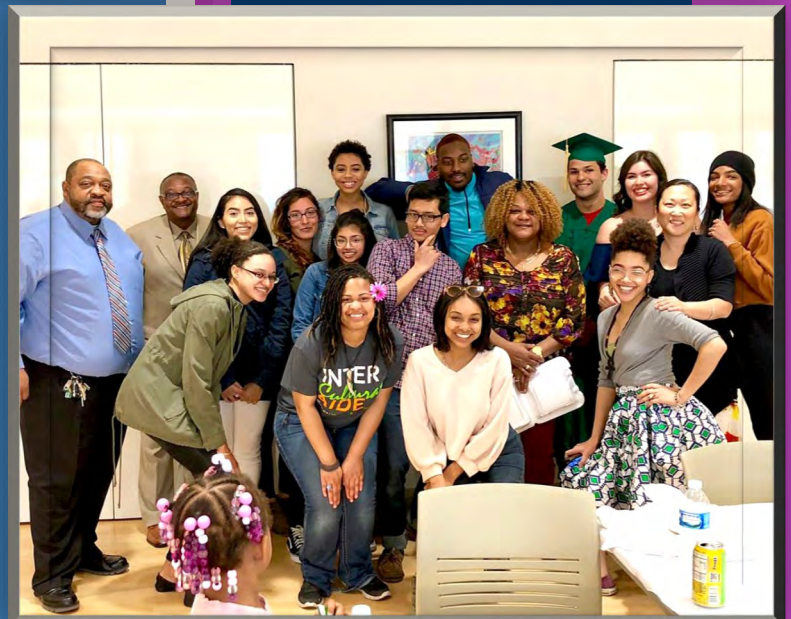
Celebrating our OCAT and MOSAIC student staff, interns and volunteers with an appreciation dinner.