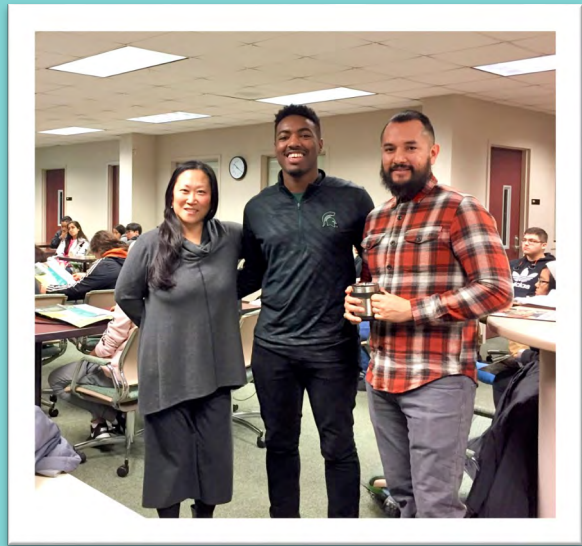
VISIT FROM WEST OTTAWA HIGH SCHOOL IN GRAND RAPIDS, MI