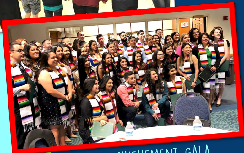
LATINO ACHIEVEMENT GALA