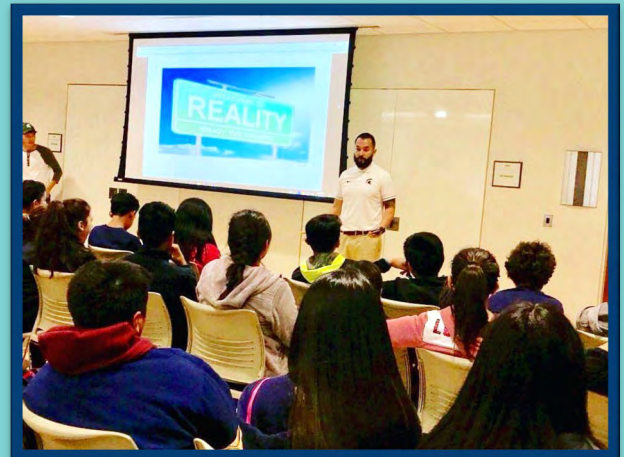
SPEAKING TO OVER 100 8TH GRADERS FROM SOUTHWEST DETROIT'S CESAR CHAVEZ ACADEMY