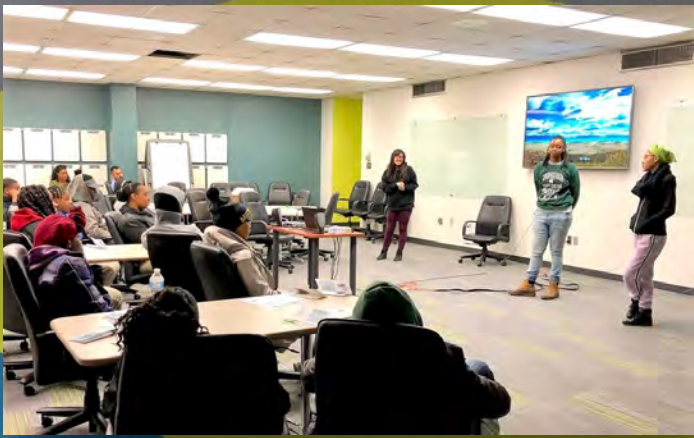
VISIT FROM WAYNE STATE UNIVERSITY'S TRIO UPWARD BOUND PROGRAM