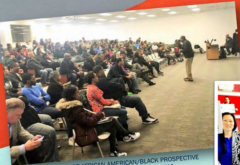
CAMPUS VISIT OF AFRICAN AMERICAN/BLACK PROSPECTIVE STUDENTS DURING MSU'S "FAMILY DAY."