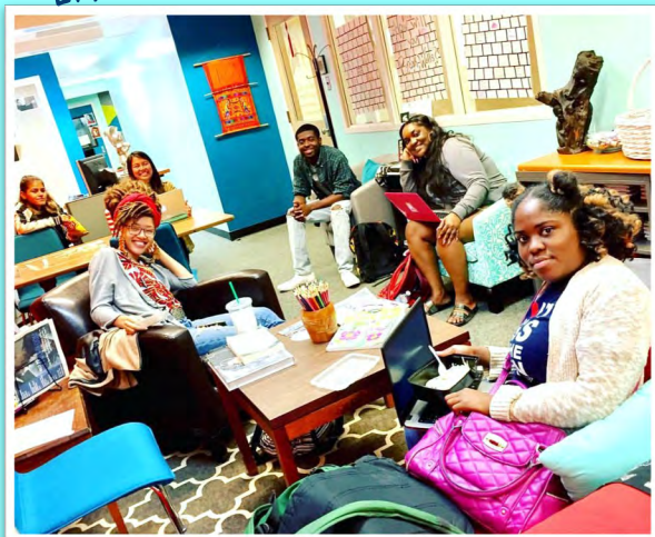
YOUR HOME AWAY FROM HOME