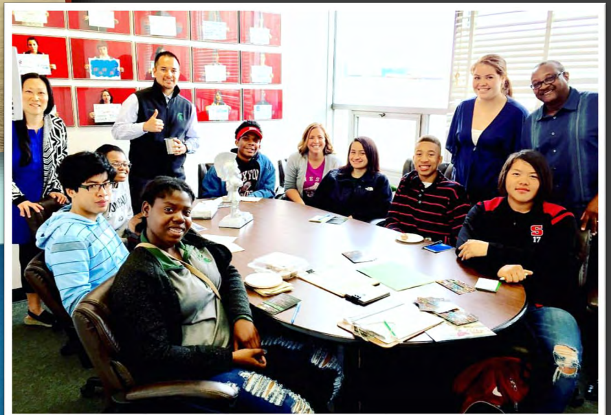
CAMPUS VISIT FROM SEXTON HIGH SCHOOL, LANSING, MI